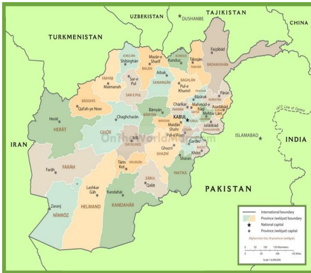
Map of Afghanistan