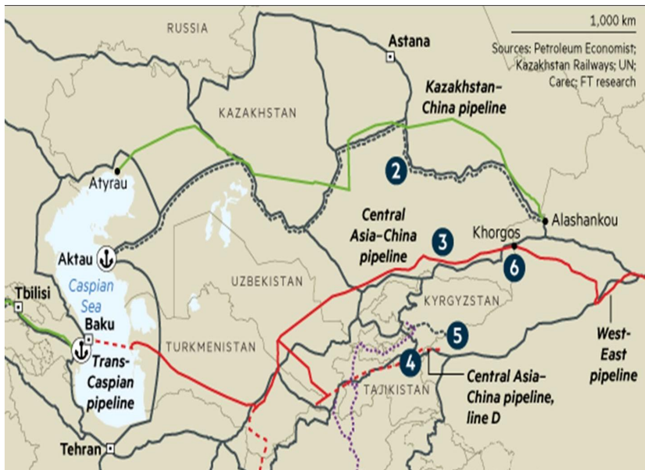
Map of oil and gas pipeline from Turkmenistan to China

Turkmenistan started in the end of 20 th Century. Mitsubishi, a Turkmen gas company and CNPC in 1992 proposed for the delivery of the natural gas of Turkmenistan to Beijing. The two companies agreed on the feasibility study of the said project and in 1996, it was finalized (Ionela Pop, 2010). Two years later, the government of China and the government of the Republic of Turkmenistan arrived at an agreement of delivering 30 billion cubic meters gas from the Republic of Turkmenistan to China in the ensuing thirty years (Niazi, 2006).