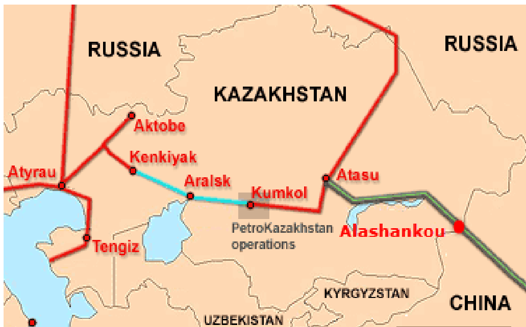
Map of oil pipeline from Kazakhstan to China

from Central Asia to China through Xinjiang. Along with the establishment of economic and political relations with CARs, it initiated its energy diversification strategy by signing energy agreements between the Republic of Kazakhstan and China's National Petroleum Company (CNPC). It got 60.3 % shares in Kazakhstan's Akzubin project in 1993, which latter on in the year 2003 increased to 85.6 % (Hawkins & Robert). Alongside an agreement was signed between China and the Republic of Kazakhstan for the construction of oil pipeline from Kazakhstan to China's Xinjiang region via mainland China, and its further distribution to its Eastern region. Resultantly, it materialized its ambition of diversifying its energy supply by stretching oil pipeline from Kazakhstan and gas pipeline from Turkmenistan in 2009.